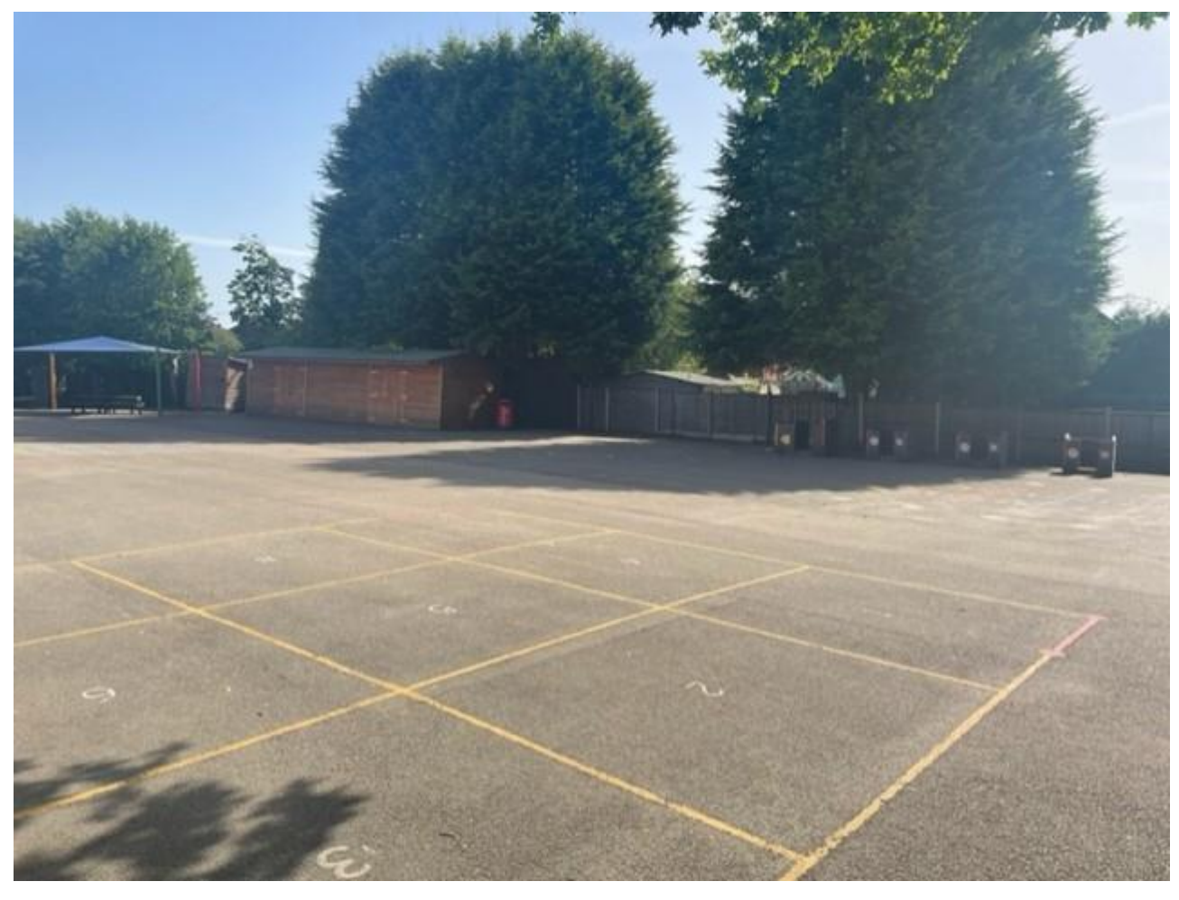
This is the Early Years playground that Reception share with Years 1 and 2, this is where you will play with all of your friends at playtimes and lunchtimes.